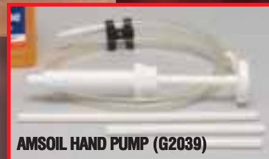
AMSOIL HAND PUMP (G2039)