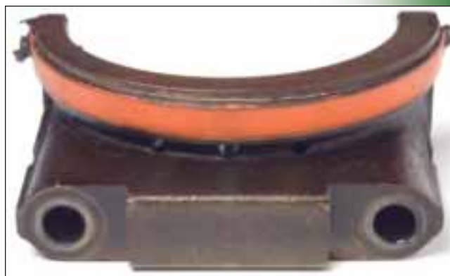
The rear main bearing cap and oil seal were in good condition. The rear seal was very pliable and still in tact, showing no signs of deterioration.