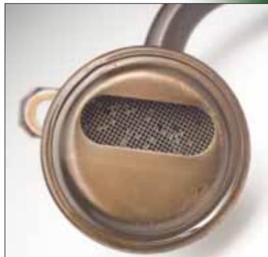
The oil pickup tube was very clean. There were minimal carbon deposits in the pickup tube screen..