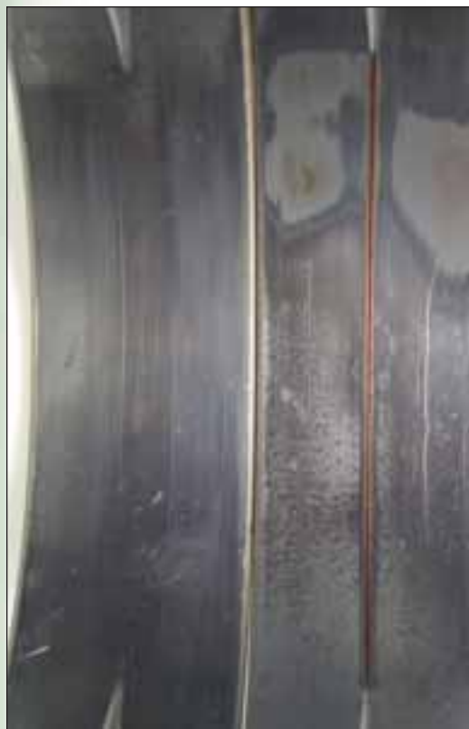
Engine main bearing halves show very little wear and are still suitable for continued use.

Each truck produces six quarts of waste-oil per oil change. With 60 vehicles being serviced every four months, that's 360 gallons per year. By switching to AMSOIL Guardian Pest Control prevents the disposal of 720 gallons of waste-oil every year. The environmental impact of this savings is enormous. It also frees up shop space that would be eaten up by drums of used oil.