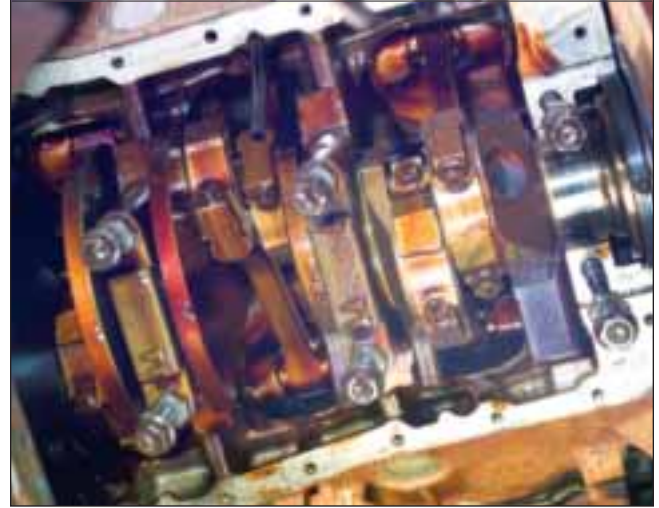
The lower crankcase area was very clean and free of any sludge deposits. The rear main bearing journal was removed showing no signs of visible wear on the crankshaft journal.