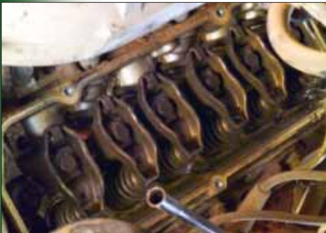
A wider view of the head and rockers. Very clean.