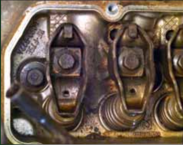
The head and rocker arms were very clean and free of heavy deposits. Note that you can still see the honey-comb stamping and manufacturer's part number. This is normally an area of the engine where you would see heavy varnish deposits with a conventional engine oil.