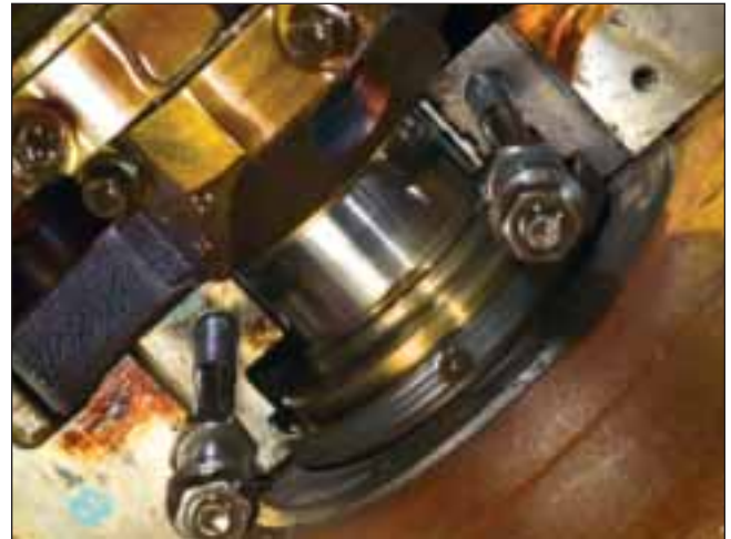
A closeup view of the rear main crankshaft journal. No visible wear detected.